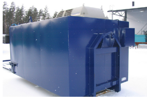
HABA bio containers