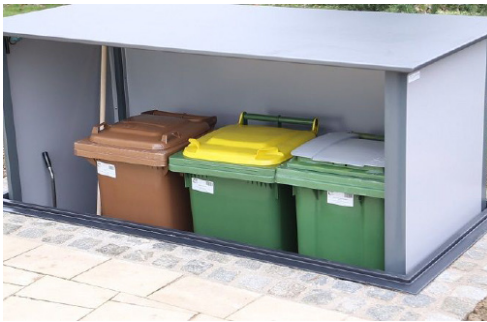
HABA HIDEOUT underground storage system