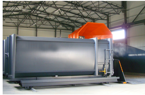
HABA waste transfer stations