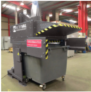
HABA BIN rotary compactors