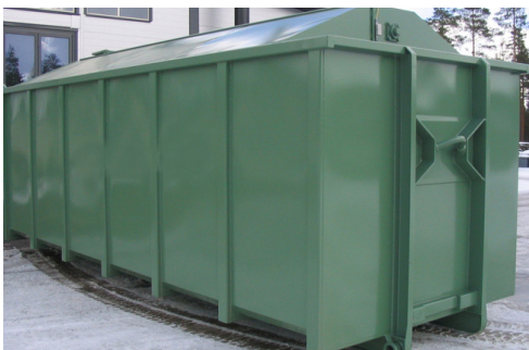
HABA screw containers