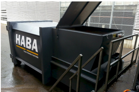
HABA combi compactors