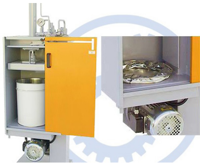
HABA bin crushers