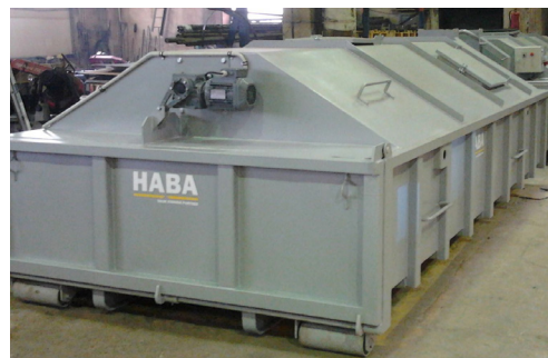
HABA ash containers