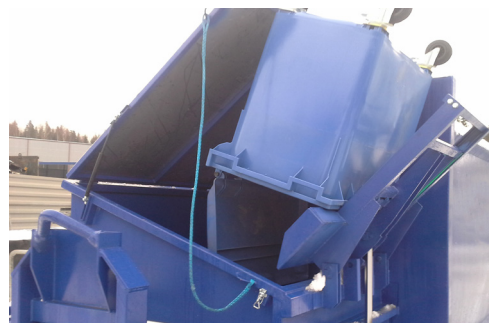
HABA tipping device