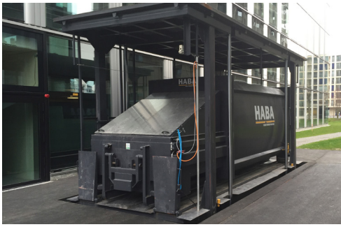
HABA MEGA underground waste compactor