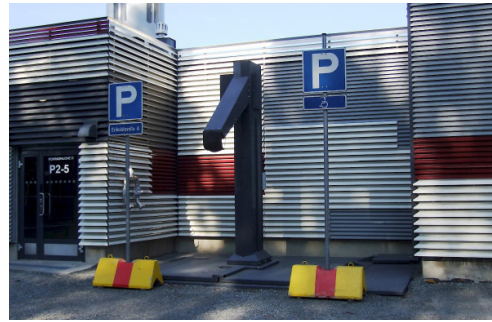
HABA underground sandilos