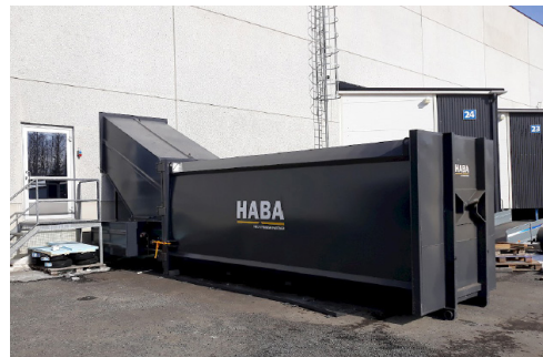
HABA detached compactors