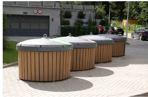
HABA SEMI deep collection containers