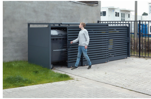
HABA STYLEOUT 1100 waste shelters