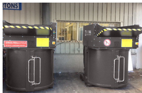
HABA rotary compactors