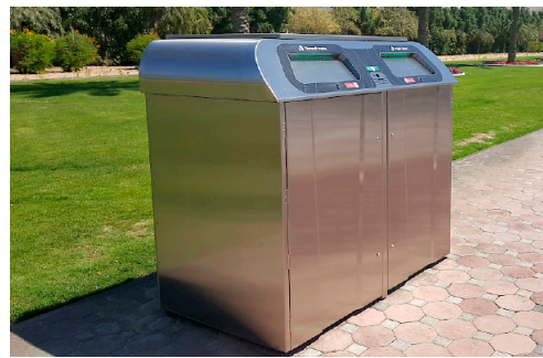
HABA SOLARSMART 2020