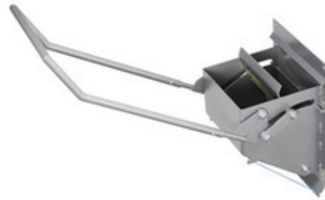
HABA can press