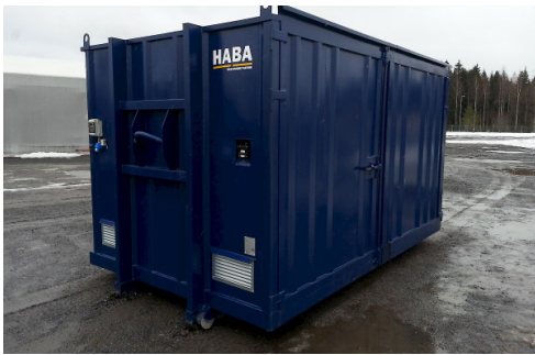
HABA hazardous waste containers