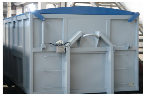
HABA open containers