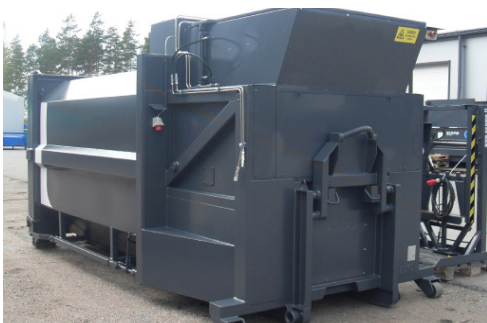
HABA pendulum compactors