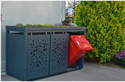
HABA STYLEOUT waste shelters