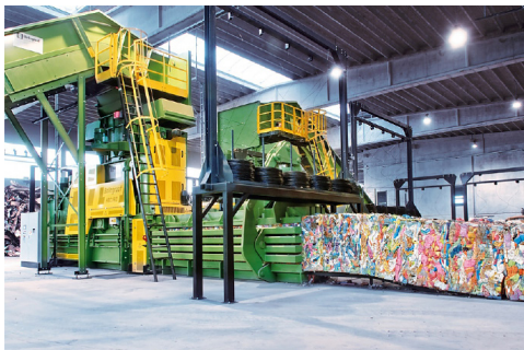
HABA vertical balers